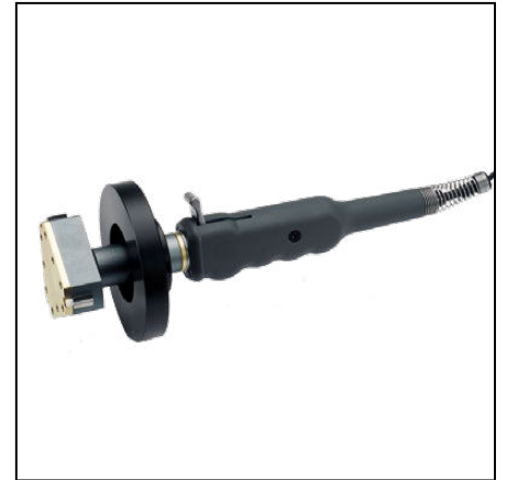
Adjustable depth stop (on request)