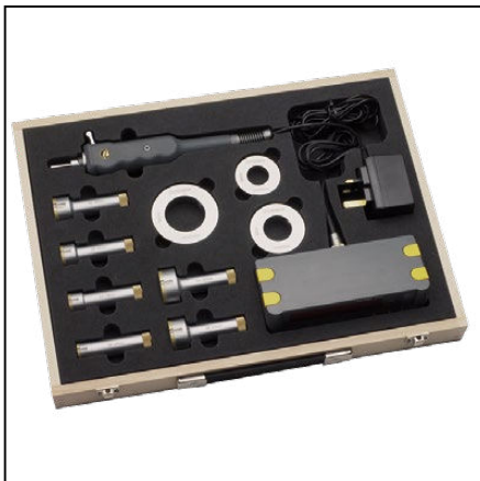
Set including 6 measuring heads, 3 master rings, 1 D50S, the handle and his probe, charging unit