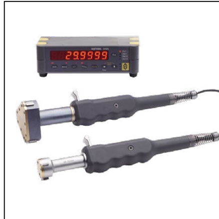
Two Ultima gauges connected with one unit Sylvac D50S only