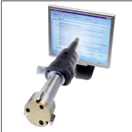
Data output through RS232